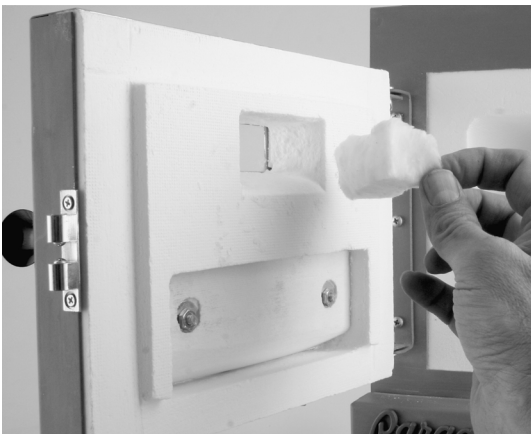
Shown above is the 1" x 3" view port.

You can conveniently watch every stage of firing through the glass view port. This is useful in fusing and slumping glass.