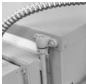
A steel rod, welded to the door, swivels inside heavy-duty hinge blocks. No wonder Paragon kilns last so long.

coating. Insulating firebrick, used throughout the firing chamber, soak up heat for slow, even cooling.