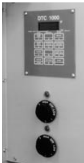
Infinite control switches balance heat between the top and sides/door.

Paragon's GL-series are made for years of rigorous firing, as artists all over America can attest. For extra strength, the insulating firebrick, wrapped in heavy-gauge steel, are cemented together in wall sections. Walls are notched in the back corners. Top and door elements are seated in firebrick grooves hardened with a dust-free